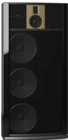
Steinway & Sons Model B Full-range loudspeaker with holographic and powerful sound