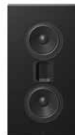
Steinway & Sons IW-26V High-performance vertical in-wall speaker with improved dynamic headroom