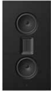
Steinway & Sons Model M Center Stylish high-performance in-wall center loudspeaker with rigid aluminum cabinet