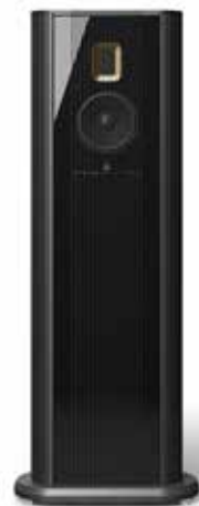
Steinway & Sons Model O Sleek and stylish full-range loudspeaker with a small footprint