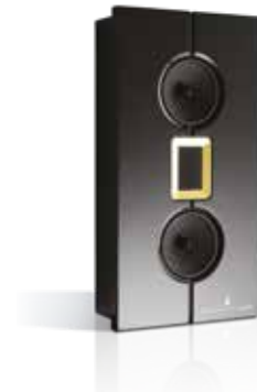
Steinway & Sons Model M L/R Stylish high-performance on- wall loudspeaker with rigid aluminum cabinet