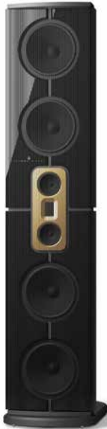
Steinway & Sons Model D Flagship full-range loudspeaker with integrated amplifier