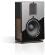
Steinway & Sons Model S-15 Petite and innovative ambi- ence-enhancing loudspeaker