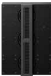
Steinway & Sons LS Center Stackable line-source center loudspeaker for large, deep rooms and long listening distance