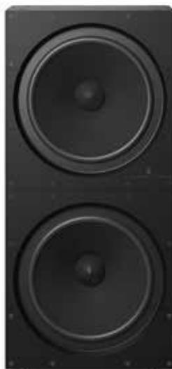
Steinway & Sons LS BW Stackable and versatile in-wall woofer for the most powerful bass in the largest rooms