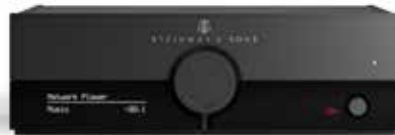
Steinway & Sons P100 Surround processor with RoomPerfect™ for the ultimate performance and immersive audio in smaller setups