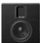
Steinway & Sons IW-16 Small high-performance in- wall speaker with improved dynamic headroom