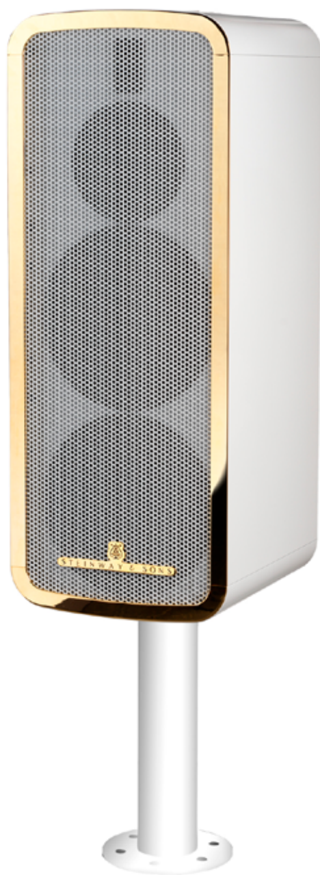
Steinway & Sons Marine Speaker Full-range loudspeaker designed for outdoor use and marine environments