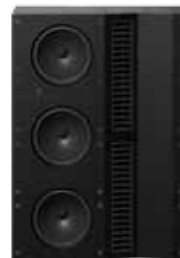
Steinway & Sons LS L/R Stackable line-source loudspeaker for large, deep rooms and long listening distance