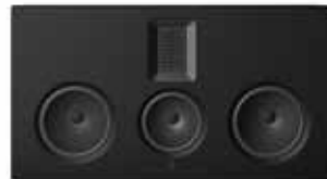
Steinway & Sons Model M L/R Stylish high-performance in-wall loudspeaker with rigid aluminum cabinet