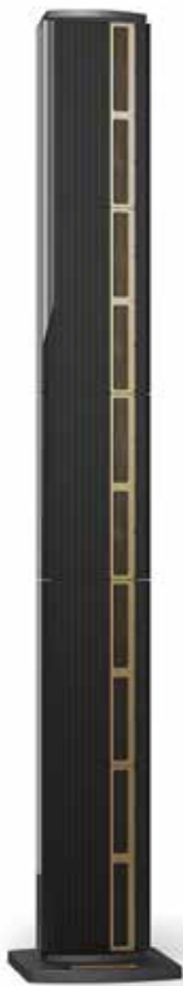
Steinway & Sons LS Concert Slim and tall line-source loudspeaker for large, deep rooms and long listening distance