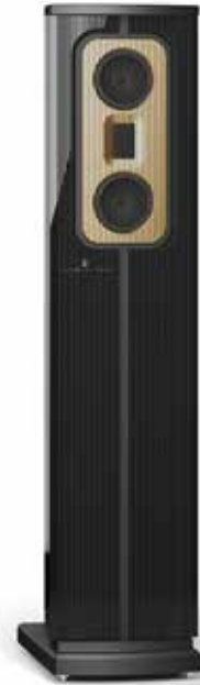
Steinway & Sons Model C Masterpiece loudspeaker with integrated amplifier