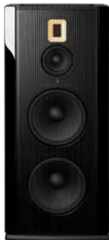
Steinway & Sons Model A Full-range loudspeaker with a powerful sound designed for placement close to a wall