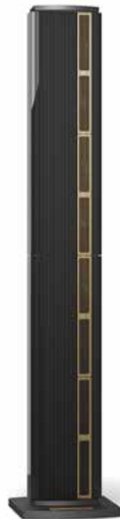
Steinway & Sons LS Studio Slim line-source loudspeaker for large, deep rooms and long listening distance