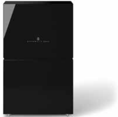
Steinway & Sons LSR-210 Stylish in-room boundary woofer for powerful and accurate bass in large rooms