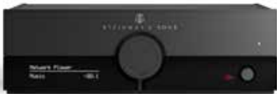
Steinway & Sons P300 2.1 Surround processor with RoomPerfect™ and HDMI 2.1 for the ultimate performance and immersive audio in larger setups