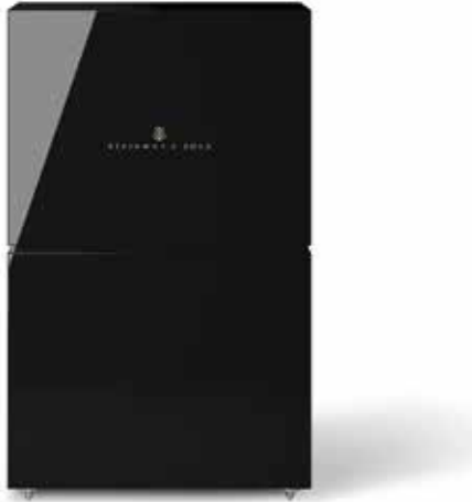
Steinway & Sons LSR-212 Stylish in-room boundary woofer for powerful and accurate bass in very large rooms