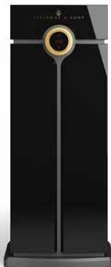
Steinway & Sons Head Unit Processor Surround and stereo processor with RoomPerfect™ for elegant in-room placement