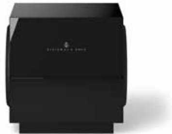
Steinway & Sons Model S-210 Discreet and stylish in-room boundary woofer for powerful and accurate bass