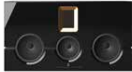
Steinway & Sons Model M Center Stylish high-performance on-wall center loudspeaker with rigid aluminum cabinet