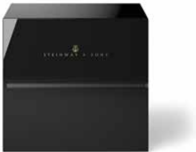
Steinway & Sons Model M BW Compact and stylish in-room boundary woofer for powerful and accurate bass